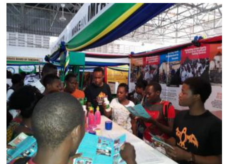
The volunteer students at Saba-Saba Show grounds on 6th July 2019.